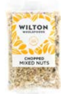
CHOPPED MIXED NUTS