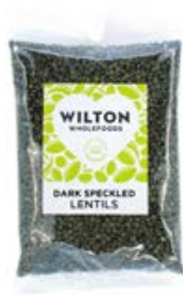
DARK SPECKLED LENTILS 12 x 500g Code: WIL047