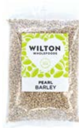
BARLEY 12 x 500g Code: WIL012