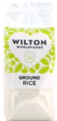
GROUND RICE 12 x 500g Code: WIL034