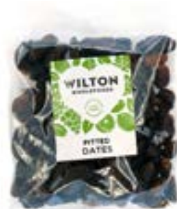
PITTED DATES 12 x 500g Code: WIL050