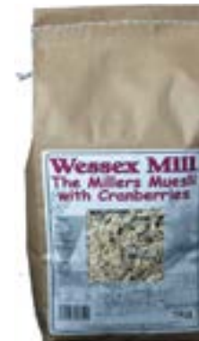
THE MILLERS MUESLI WITH CRANBERRY 5 x 1kg Code: WES103