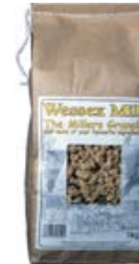
THE MILLERS GRANOLA 5 x 1Kg Code: WES101