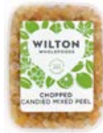
CHOPPED MIXED PEEL