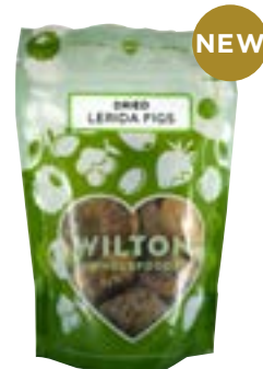
LERIDA FIGS 12 x 250g Code: WIL083