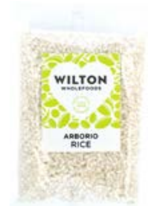
ARBORIO RICE 12 x 500g Code: WIL010