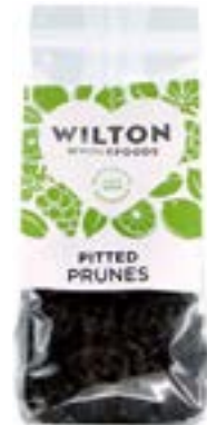
PRUNES 12 x 250g Code: WIL037