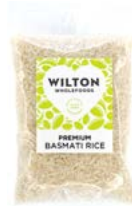
PREMIUM BASMATI RICE 12 x 500g Code: WIL006