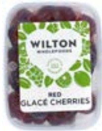
RED GLACE CHERRIES

WILTON WHOLEFOODS Experts at sourcing, mixing, blending, and packing the best natural foods from all over the world.