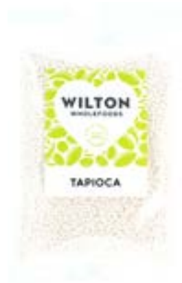
TAPIOCA 12 x 375g Code: WIL025