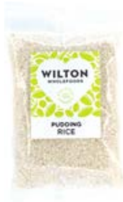
PUDDING RICE 12 x 500g Code: WIL008