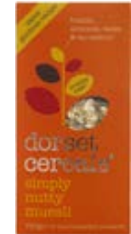
SIMPLY NUTTY MUESLI 5 x 560g Code: DOR014