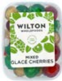
MIXED GLACE CHERRIES