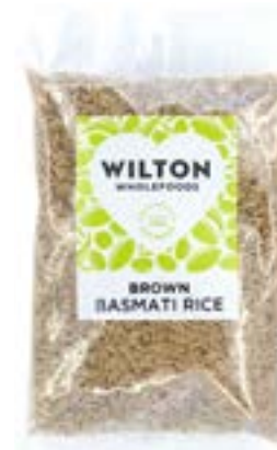
LONG GRAIN BROWN RICE 12 x 500g Code: WIL007