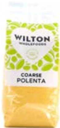
COARSE POLENTA 12 x 500g Code: WIL035