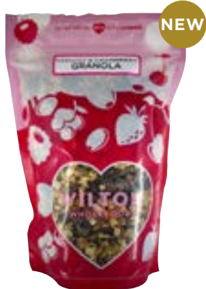
APRICOT & CRANBERRY GRANOLA 12 x 500g Code: WIL093