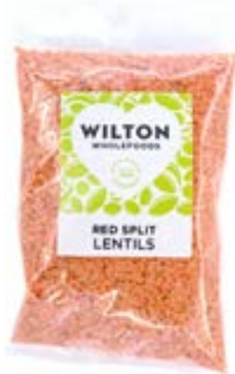
RED SPLIT LENTILS 12 x 500g Code: WIL004