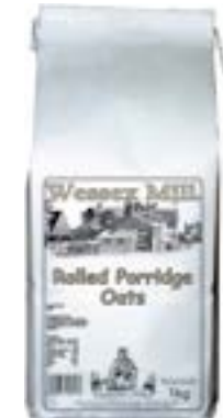
ROLLED PORRIDGE OATS 5 x 1kg Code: WES104