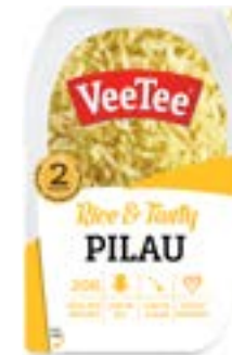
PILAU RICE 6 x 280g Code: VEE003