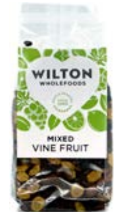
MIXED VINE FRUITS 12 x 375g Code: WIL068