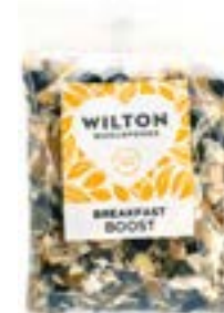
BREAKFAST BOOST 12 x 250g Code: WIL062