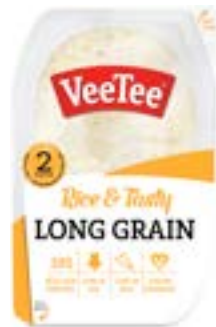
LONG GRAIN RICE 6 x 300g Code: VEE001

NEW VEETEE Premium quality rice, with absolutely no artificial additives. Easy cook and ready in minutes