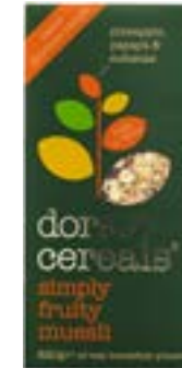
SIMPLY FRUITY MUESLI 5 x 630g Code: DOR012