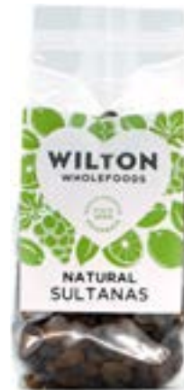
SULTANAS 12 x 375g Code: WIL015