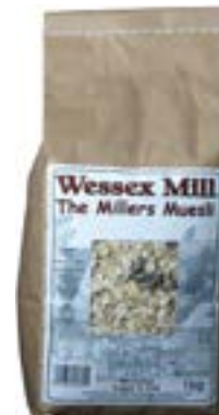
THE MILLERS MUESLI 5 x 1Kg Code: WES102