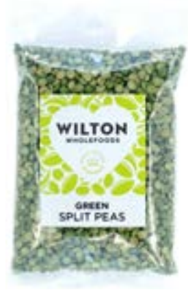
GREEN SPLIT PEAS 12 x 500g Code: WIL039