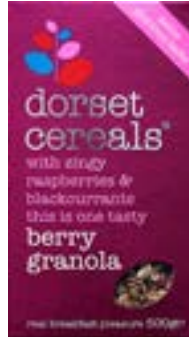
BERRY GRANOLA 5 x 500g Code: DOR015