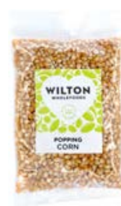
POPPING CORN 12 x 500g Code: WIL005