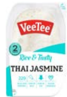
THAI JASMINE RICE 6 x 300g Code: VEE004