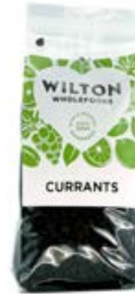
CURRENTS 12 x 375g Code: WIL049