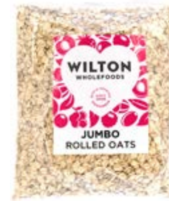
JUMBO ROLLED OATS 12 x 500g Code: WIL001