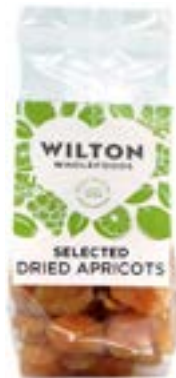
APRICOTS 12 x 250g Code: WIL017