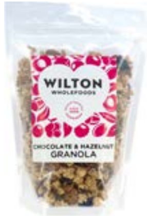
CHOCOLATE & HAZELNUT GRANOLA 12 x 500g Code: WIL043