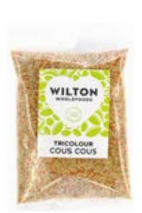
TRICOLOUR COUS COUS 12 x 375g Code: WIL061