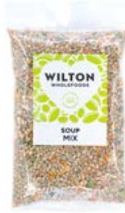
SOUP MIX 12 x 500g Code: WIL036