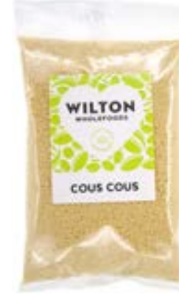
COUS COUS 12 x 500g Code: WIL011