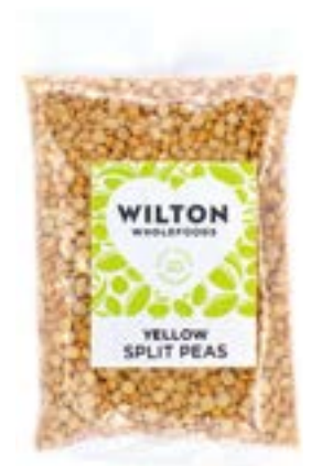
YELLOW SPLIT PEAS 12 x 500g Code: WIL013