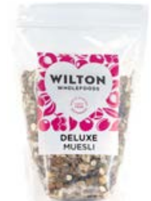
DELUXE MUESLI 12 x 500g Code: WIL003