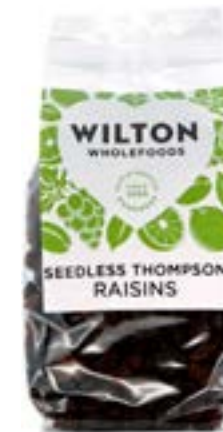
SEEDLESS RAISINS 12 x 375g Code: WIL016