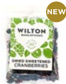
DRIED SWEETENED CRANBERRIES 12 x 100g Code: WIL055