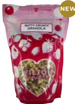
NUTTY CRUNCH GRANOLA 12 x 500g Code: WIL094