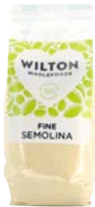
SEMOLINA 12 x 500g Code: WIL009

NEW VEETEE Premium quality rice, with absolutely no artificial additives. Easy cook and ready in minutes