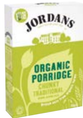
ORGANIC PORRIDGE OATS 6x750g Code: JOR005