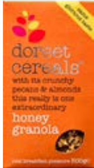
HONEY GRANOLA 5 x 500g Code: DOR011