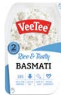
BASMATI RICE 6 x 280g Code: VEE002