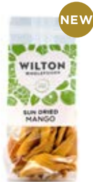
SUN DRIED MANGO 12 x 75g Code: WIL092