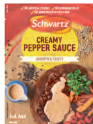
CREAMY PEPPER SAUCE MIX 12 x 25g Code: SCW003