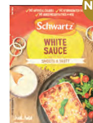
WHITE SAUCE 12 x 25g Code: SCW027