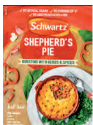
SHEPHERD'S PIE MIX 12 x 38g Code: SCW005