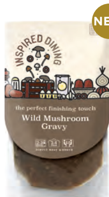
WILD MUSHROOM GRAVY 8 x 200g Code: ATK046