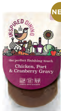
CHICKEN, CRANBERRY & PORT GRAVY 8 x 200g Code: ATK045