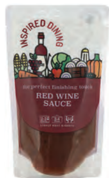
RED WINE SAUCE 8 x 200g Code: ATK035