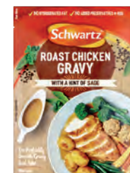
ROAST CHICKEN GRAVY 12 x 26g Code: SCW016