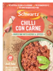
CHILLI CON CARNE 12 x 41g Code: SCW004