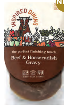
BEEF & HORSE RADISH GRAVY 8 x 200g Code: ATK042