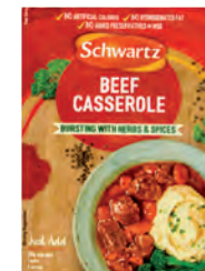
BEEF CASSEROLE RECIPE MIX 12 x 43g Code: SCW007