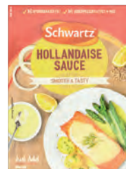
HOLLANDAISE SAUCE MIX 12 x 25g Code: SCW018