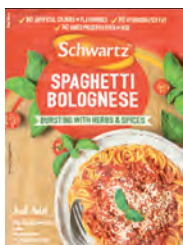
SPAGHETTI BOLOGNESE 12 x 40g Code: SCW008