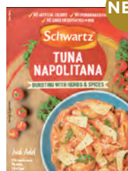
TUNA NAPOLITANA 12 x 30g Code: SCW022