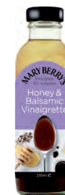
HONEY & BALSAMIC VINAIGRETTE 6 x 235ml Code: MAR007