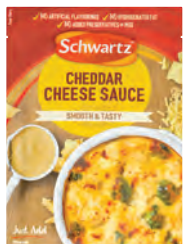
CHEDDAR CHEESE SAUCE MIX 12 x 40g Code: SCW001