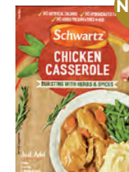
CHICKEN CASSEROLE 12 x 36g Code: SCW023