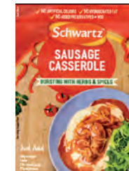
SAUSAGE CASSEROLE 12 x 35g Code: SCW006