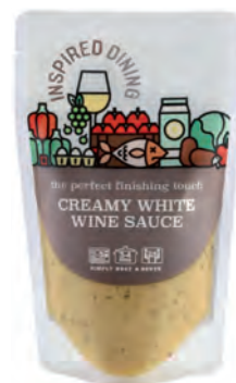
WHITE WINE SAUCE 8 x 200g Code: ATK036