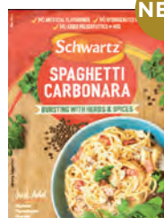
SPAGHETTI CARBONARA 12 x 32g Code: SCW026