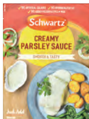
CREAMY PARSLEY SAUCE MIX 12 x 26g Code: SCW002