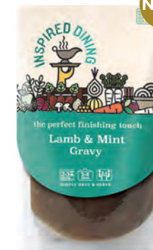
LAMB & MINT GRAVY 8 x 200g Code: ATK043