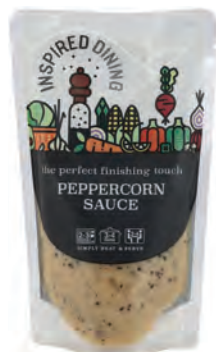
PEPPERCORN SAUCE 8 x 200g Code: ATK033