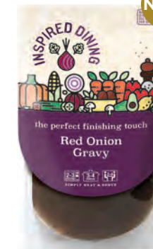
RED ONION GRAVY 8 x 200g Code: ATK044