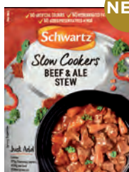
BEEF & ALE STEW 12 x 43g Code: SCW025