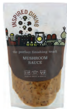
MUSHROOM SAUCE 8 x 200g Code: ATK034