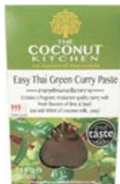
EASY THAI GREEN CURRY PASTE 6 x 130g Code: TCK007