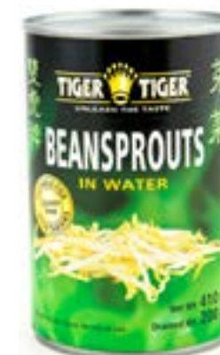
BEAN SPROUTS 12 x 410 g Code: BLU012