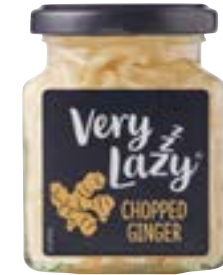
CHOPPED GINGER 6 x 190g Code: SEA009