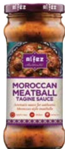
MOROCCAN MEATBALL TAGINE SAUCE 6 x 350g Code: ALF008