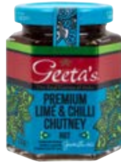
PREMIUM LIME & CHILLI CHUTNEY