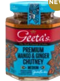
MANGO & GINGER CHUTNEY