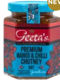
MANGO & CHILLI CHUTNEY