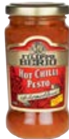
..... HOT CHILLI PESTO 6 x 190g Code: FIL008