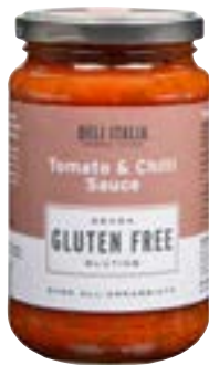
TOMATO & CHILLI PASTA SAUCE GLUTEN FREE 6 x 350g Code: EPI085