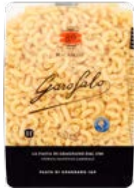
MACARONI 16 x 500g Code: GAR101