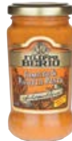
..... TOMATO & RICOTTA PESTO 6 x 190g Code: FIL009