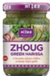
GREEN HARISSA 6 x 100g Code: ALF010