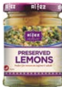
PRESERVED LEMONS 6 x 140g Code: ALF011