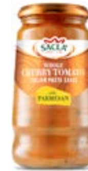
WHOLE CHERRY TOMATO & PARMESAN PASTA SAUCE 6 x 350g Code: SAC008