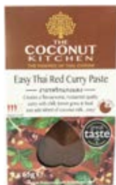
EASY THAI RED CURRY PASTE 6 x 130g Code: TCK006