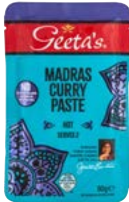
MADRAS CURRY PASTE