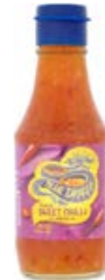
SWEET CHILI DIPPING SAUCE