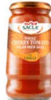
WHOLE CHERRY TOMATO & CHILLI PASTA SAUCE 6 x 350g Code: SAC007