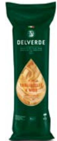
..... TAGLIATELLE NESTS 12 x 250g Code: DVE005

FILIPPO BERIO Have been creating the finest products since 1867 and is the UK's most popular olive oil brand. The company is passionately committed to the very best of Italy's culinary heritage.