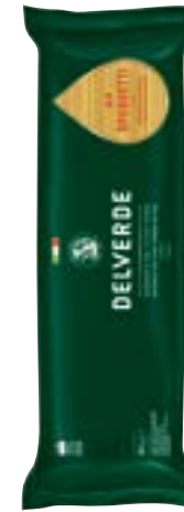
..... SPAGHETTI 24 x 500g Code: DVE001