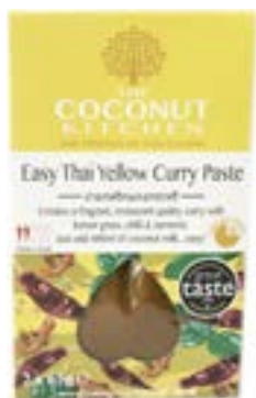
EASY THAI YELLOW CURRY PASTE 6 x 130g Code: TCK005

THE COCONUT KITCHEN Restaurant quality Thai curry pastes and sauces all developed by Wales's most talented Thai chef in her restaurant in Abersoch. With these sauces you can easily re-create amazingly delicious restaurant dishes at home.