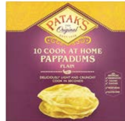
PLAIN PAPPADUMS READY TO COOK