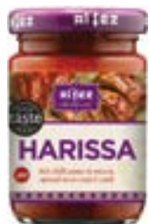
HARISSA PASTE 6 x 100g Code: ALF009

AL'FEZ At the heart of every Al'Fez product lies the promise of discovery; and we have put together a delightful selection of North African and Middle Eastern inspired products for you to enjoy.