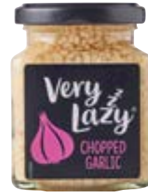
CHOPPED GARLIC 6 x 200g Code: SEA008