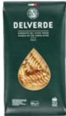
..... FUSILLI 20 x 500g Code: DVE002

DELVERDE Only the best durum wheat semolina and the purest spring water, direct from the source of the Verde River in southern Italy, are used to make this fine quality pasta.