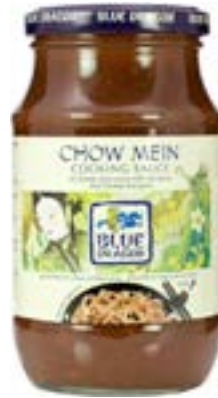
CHOW MEIN COOKING SAUCE