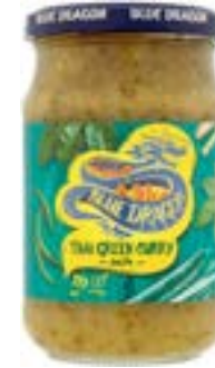
THAI GREEN CURRY PASTE