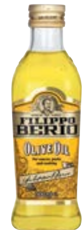
..... OLIVE OIL 6 x 500ml Code: FIL002