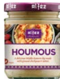
HOUMOUS DIP 6 x 160g Code: ALF003