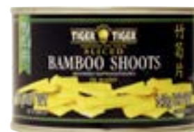
SLICED BAMBOO SHOOTS 12 x 227g Code: TIG002