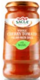
WHOLE CHERRY TOMATO & BASIL PASTA SAUCE 6 x 350g Code: SAC006