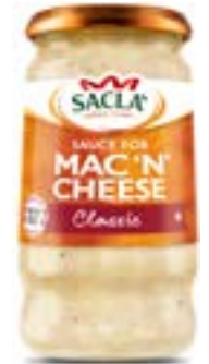
MAC 'N' CHEESE CLASSIC SAUCE 6 x 350g Code: SAC009