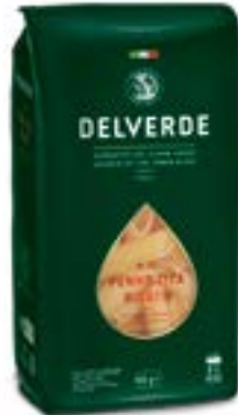
..... PENNE RIGATE 20 x 500g Code: DVE003