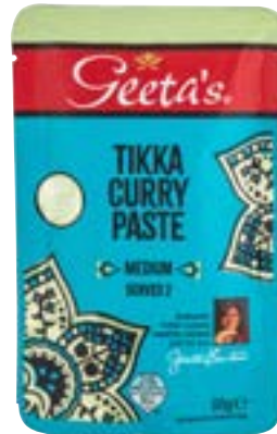
TIKKA CURRY PASTE