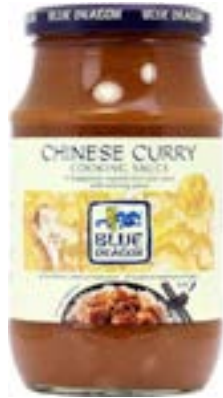
CHINESE CURRY COOKING SAUCE