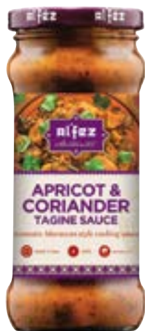
APRICOT & CORIANDER TAGINE SAUCE 6 x 350g Code: ALF002