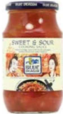
SWEET & SOUR COOKING SAUCE