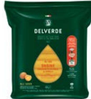
..... LASAGNE EGG 12 x 500g Code: DVE006