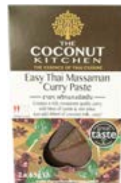
EASY THAI MASSAMAN CURRY PASTE 6 x 130g Code: TCK008