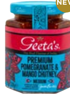
POMEGRANATE & MANGO CHUTNEY