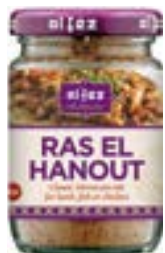
RAS EL HANOUT SPICE MIX 6 x 42g Code: ALF006