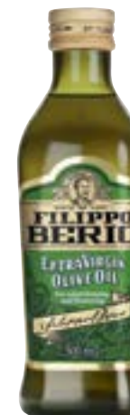
..... EXTRA VIRGIN OLIVE OIL 6 x 500ml Code: FIL001