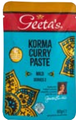
KORMA CURRY PASTE