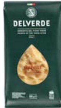
..... FARFALLE 20 x 500g Code: DVE004