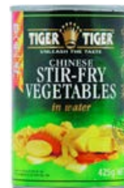
STIR FRY VEGETABLES 12 x 425g Code: TIG003