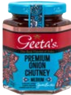
PREMIUM ONION CHUTNEY