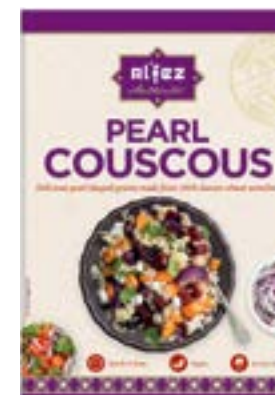
PEARL COUSCOUS 12 x 200g Code: ALF015