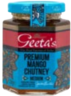
PREMIUM MANGO CHUTNEY