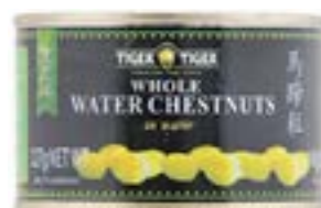
WHOLE WATER CHESTNUTS 12 x 227g Code: TIG001