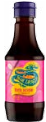
RICH HOISIN SAUCE