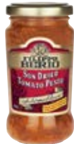
..... SUNDRIED TOMATO PESTO 6 x 190g Code: FIL007