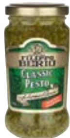
..... CLASSIC PESTO 6 x 190g Code: FIL006

FILIPPO BERIO Have been creating the finest products since 1867 and is the UK's most popular olive oil brand. The company is passionately committed to the very best of Italy's culinary heritage.