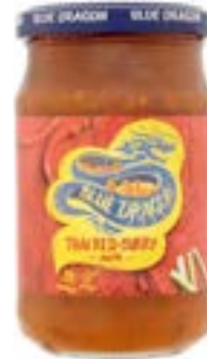
THAI RED CURRY PASTE