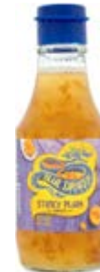
STICKY PLUM SAUCE