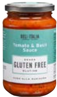
TOMATO & BASIL PASTA SAUCE GLUTEN FREE 6 x 350g Code: EPI084