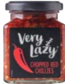
CHOPPED RED CHILLIES 6 x 190g Code: SEA007