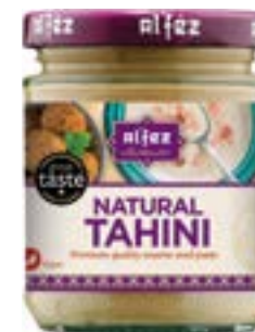
NATURAL TAHINI 6 x 160g Code: ALF012