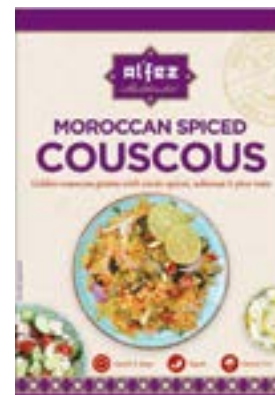
MOROCCAN STYLE COUSCOUS 12 x 200g Code: ALF001