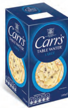
LARGE TABLE WATER BISCUITS 6 x 200g Code: CAR003