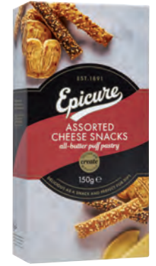
ASSORTED CHEESE SNACKS 14 x 150g Code: EPI079

PETER'S YARD Ultra thin and crunchy crispbread based on an original Swedish recipe.