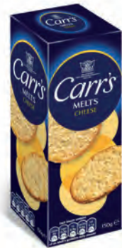
CHEESE MELTS 12 x 150g Code: CAR001