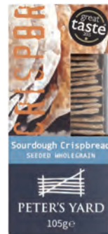
SEEDED WHOLEGRAIN SOURDOUGH CRISPbread 12 x 105g Code: PET006