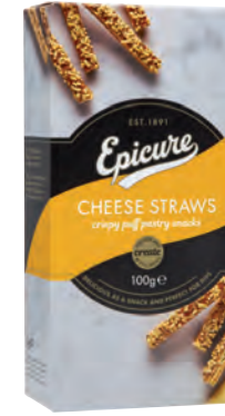
CHEESE STRAWS 10 x 100g Code: EPI078