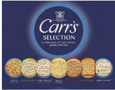
SELECTION 6 x 200g Code: CAR005