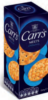
MELTS 12 x 150g Code: CAR002