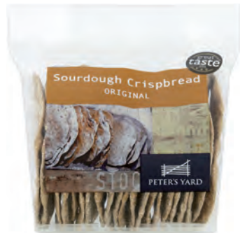
SOURDOUGH CRISPbread ORIGINAL STANDARD SIZE 12 x 200g Code: PET001

PETER'S YARD Ultra thin and crunchy crispbread based on an original Swedish recipe.